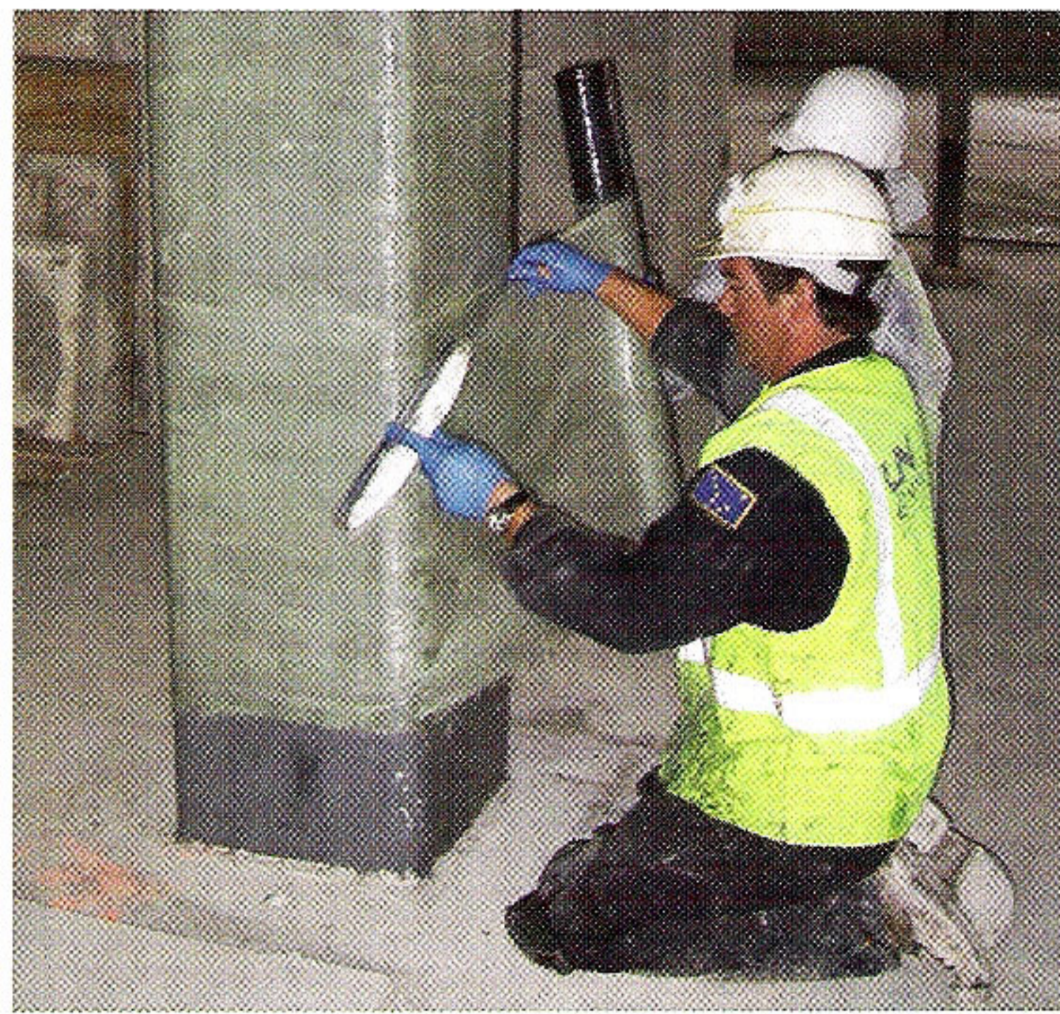
Fig. 3: Wrapping of columns with GFRP

For the east- and west-side shearwalls, boundary elements were created by wrapping horizontally oriented unidirectional glass fabrics on the three