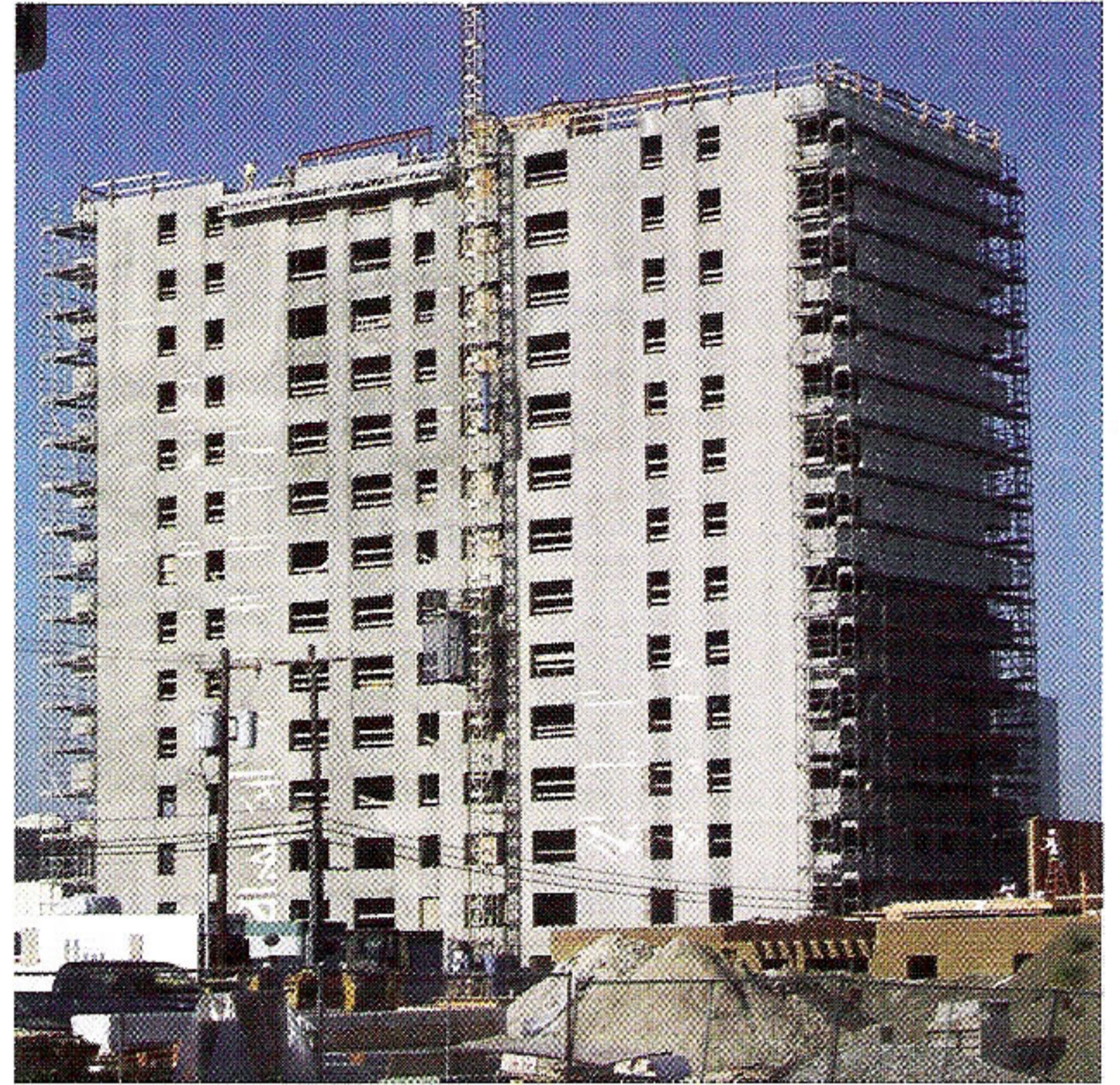
Fig. 2: Stripped building was an eyesore for over 20 years

The McKinley Tower Apartment Building is a 14-story reinforced concrete high-rise structure, constructed in 1951-52 in Anchorage, AK. The total height of the building is 122 ft (37 m), and it has a rectangular footprint of 130 by 52 ft (40 by 16 m), giving it a total of 108,160 ft 2 (10,048 m 2 ) of construction, including basement and roof.