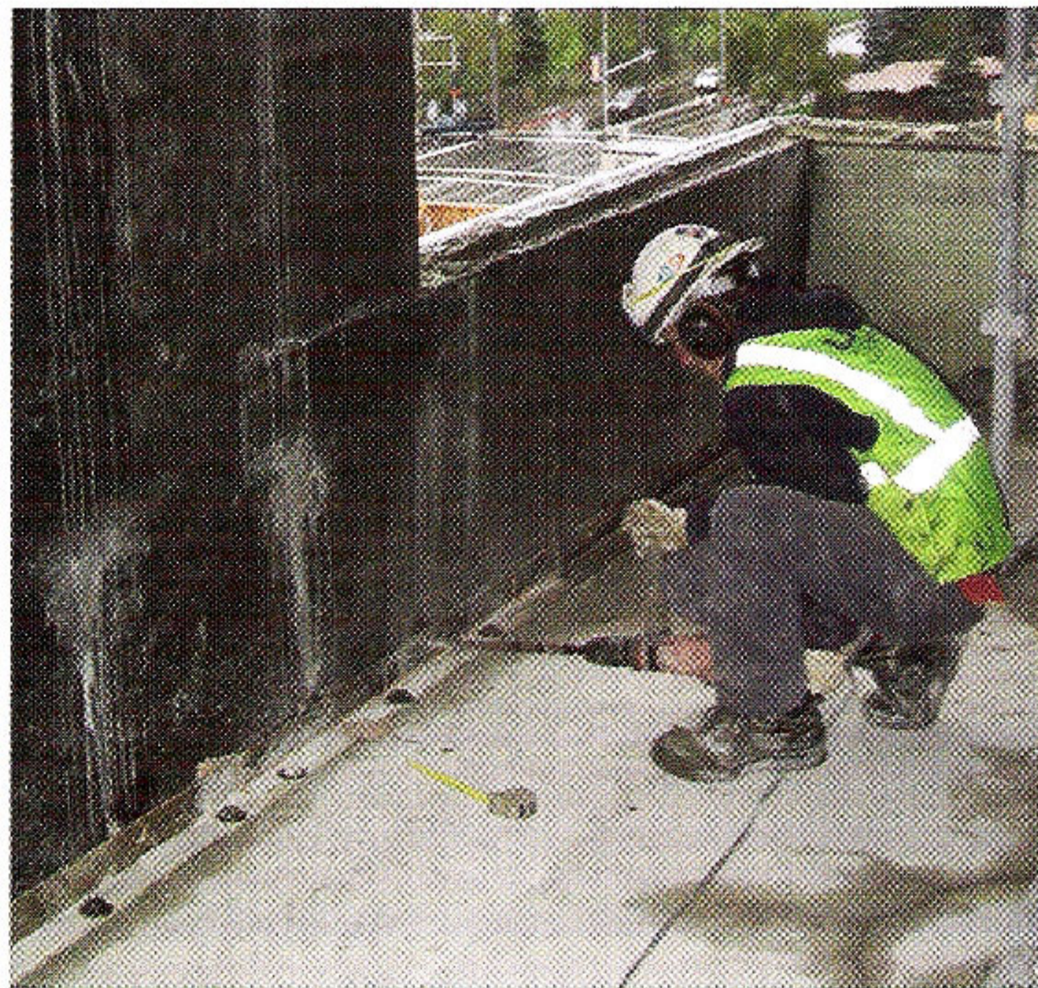
Fig. 4: Steel angles and bolts for transfer of loads from shearwalls to floors

sides of window corner openings. Additional 5/8-in. A307 bolts were specified to provide proper confinement of the boundary elements.