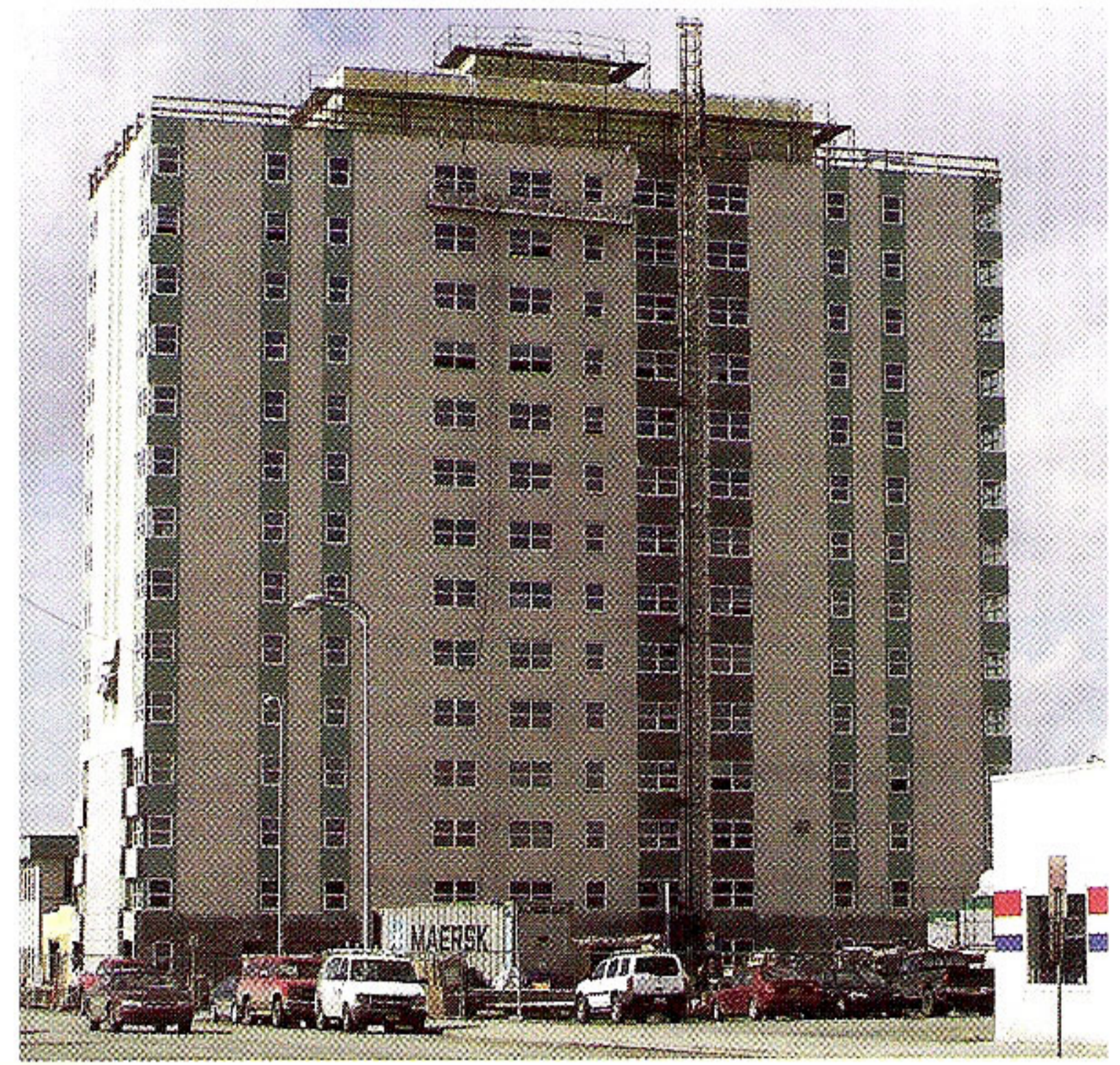
Fig. 6: The building nearly completed and painted

to interior floor use, especially when remodeling projects are undertaken. By eliminating the need for these walls, these restrictions were abolished above the 4th floor, where the new interior shear construction was stopped;