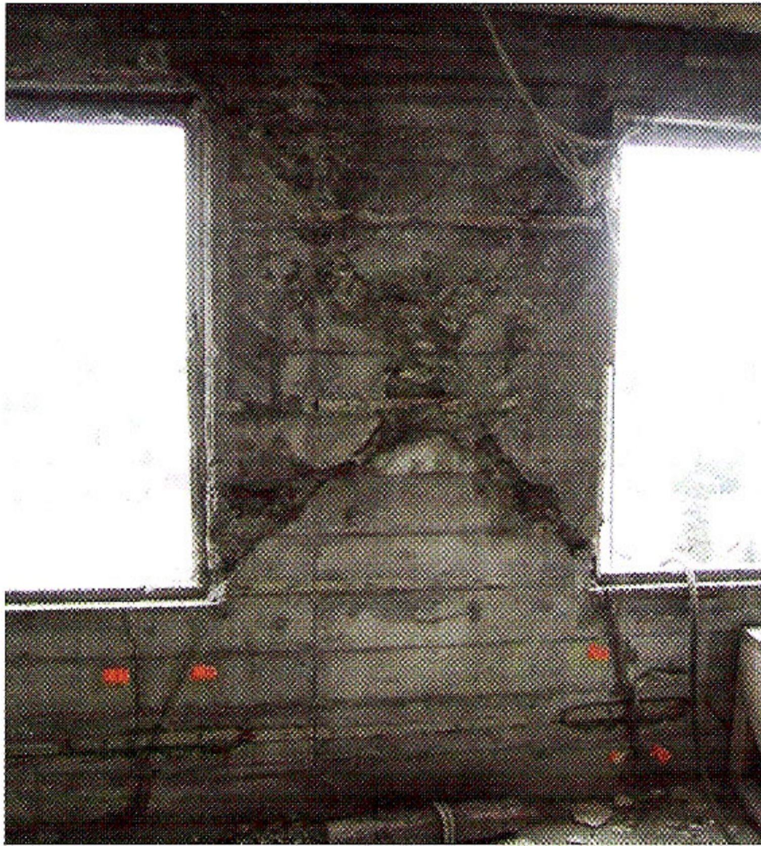
Fig. 1: Damage to walls caused by the earthquake